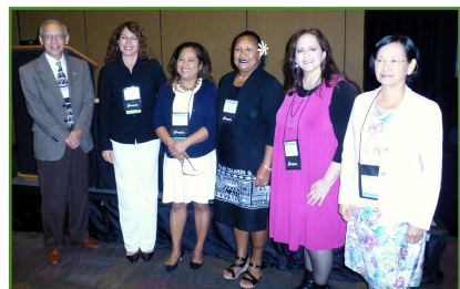
Panel & Consultants, 2019 NOHC