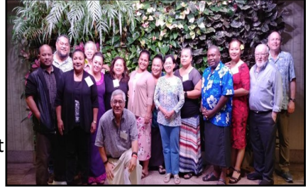
Hawaii PBDA Members' Meeting