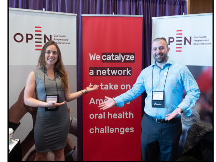
2019 NOHC Exhibit Hall