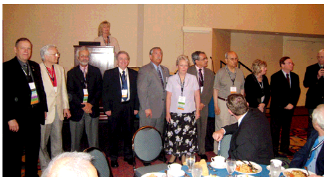
ASTDD Past Presidents

By the American Association of Public Health Dentistry (AAPHD), featured 4 plenary sessions, 26 concurrent sessions (3 of these were oral contributed papers), 41 roundtables, 84 posters, 18 sponsoring exhibitors and 5 non-profit exhibitors. ASTDD also sponsored a Pacific Basin Dental Association (PBDA) meeting. In addition to the 81 speakers for contributed abstracts, there were 85 speakers for the invited sessions, including the pre-conference sessions on April 26-27. Workshops focused on the topics of Medicaid/SCHIP 101 , Framing Oral Health: Communication Strategies for Oral Health Advocates , and A Policy Tool for States . The program planning committee included 23 representatives from 12 national organizations and federal agencies. They reviewed abstracts submitted for plenary and concurrent sessions and created a very thought-provoking and interesting program to meet the diverse needs of the more than 750 participants who attended. Enhancements to the NOHC website, initiation of an online CE and evaluation process, and other logistical changes resulted in a 50% increase in efficiency reported by the meeting planners, MRSI. Plans are in place for the next three NOHCs: April 20-22, 2009 in Portland, OR; April 26-28, 2010 in St Louis, MO; and April 11-13 in Pittsburgh, PA.