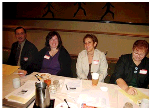
2008 Partners Meeting

The ASTDD/AAPHD/ADA Dental Public Health (DPH) Task Force continues to address dental public health workforce issues and advocates for inclusion of DPH and state oral health program infrastructure development as part of any healthcare reform effort. The Task Force submitted a document to the ADA Council on Access, Prevention and Interprofessional Relations requesting inclusion of dental public health in their Task Force on the Future of Health Care/Universal Coverage. Dr. Don Marianos, ASTDD consultant, discussed the paper at the April 2008 meeting of the ADA Task Force, and the concepts were well received. Dr. Marianos also represents ASTDD on the ASTHO Access Policy Committee; this committee has identified oral health as a priority area for activity this year.