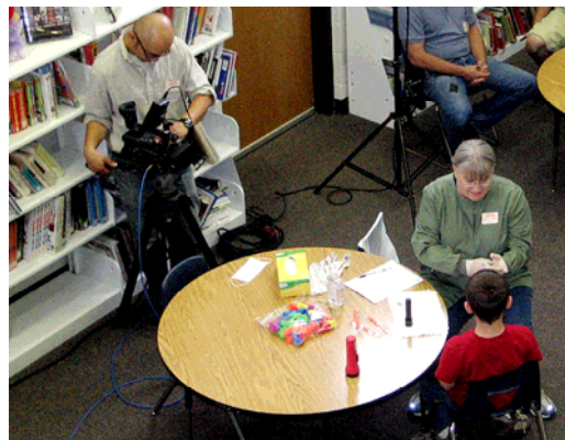
Filming in Nevada