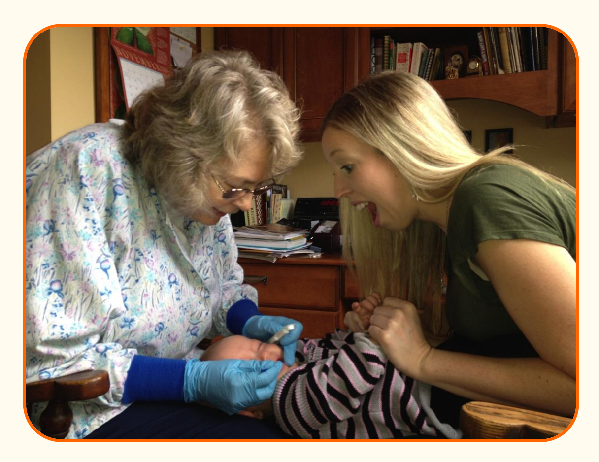
Sheldon Head Start