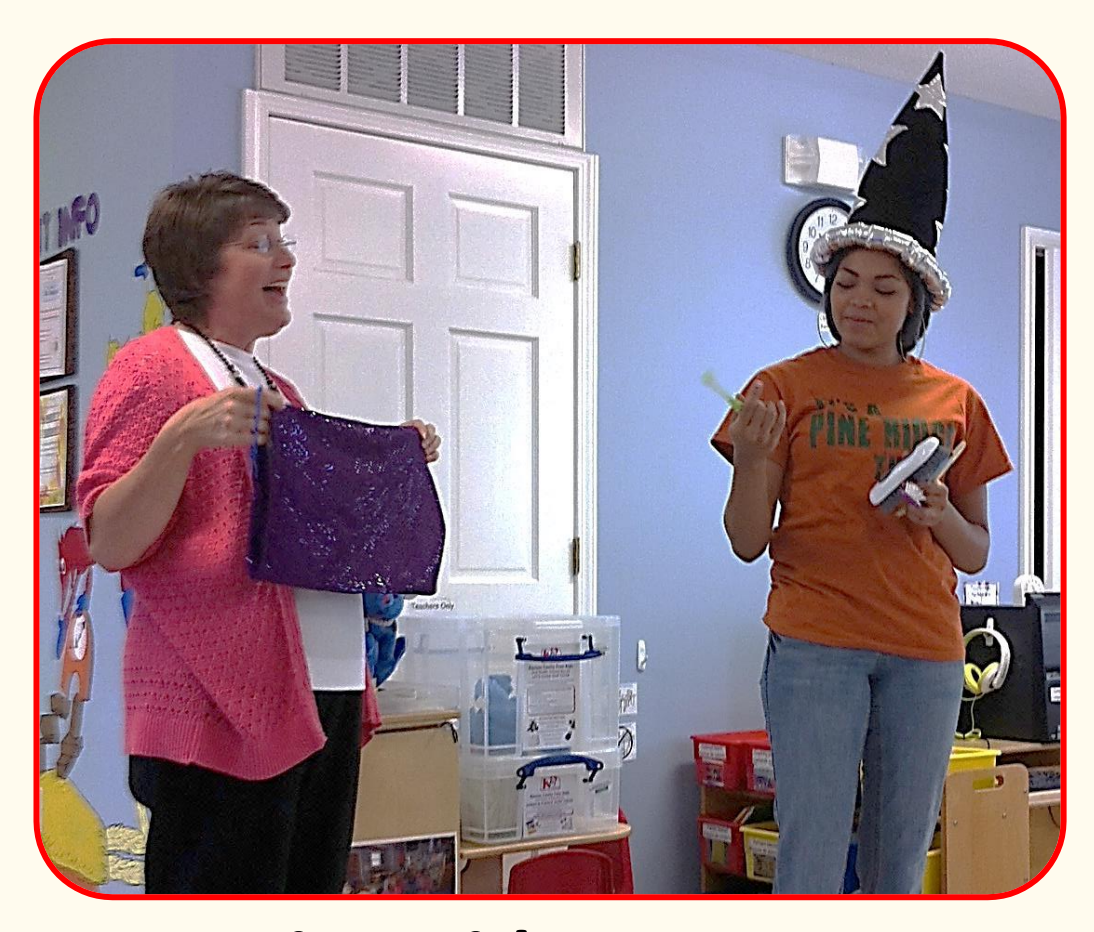
Pine Ridge Prep